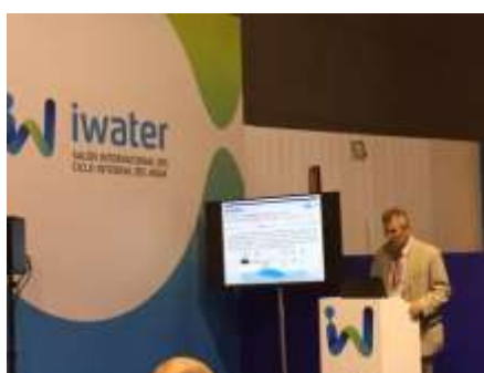
MARSOL and MtoM presentation at iWater Barcelona international trade

During iWater international event, MtoM was mentioned during the presentation: Managed Aquifer Recharge as a technique to face frontally climate change adverse impacts.