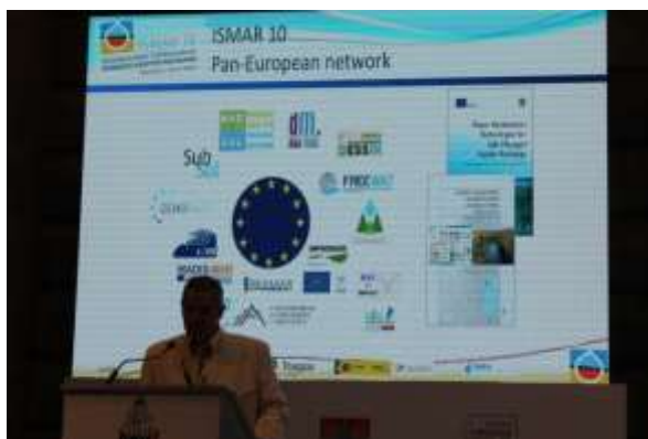
Presentation of MAR Paneuropean network during ISMAR 10 slot in Mexico, ISMAR 9 conference