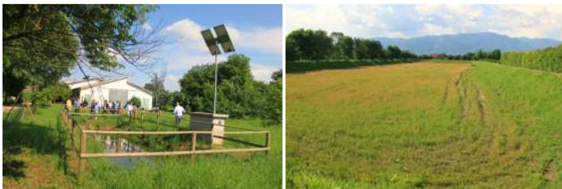
MAR to MAR-k€t presence in Venice workshop.

The Rio Brenta demonstration sites were visited by the participants, and the monitoring system, modeling activities, and respective results were presented.