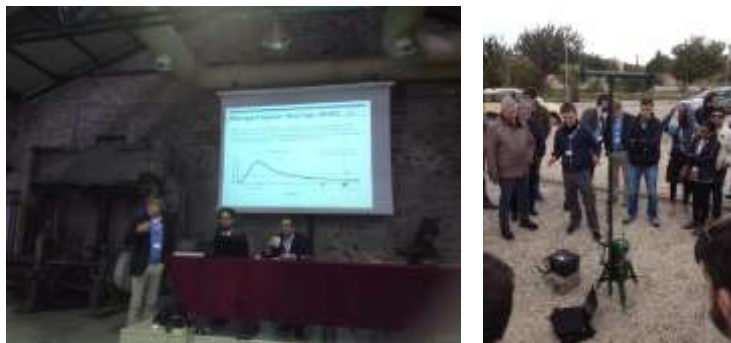
MAR to MAR-k€t presence in Lavrion workshop.

The workshop featured in-door sessions as well as participation in active field work and site visits.