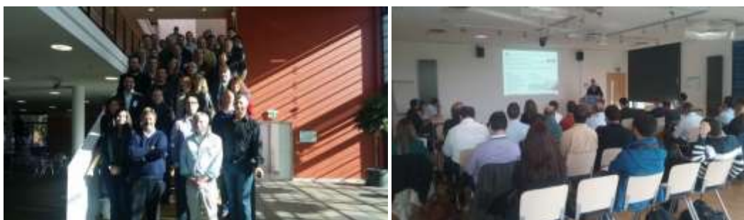
MAR to MAR-k€t presence in Leipzig MARSOL final workshop.

21 partners shared their expertise collected along three years in a three days MARSOL final workshop, with presence of the whole consortium, both member of the MAR to MAR-k€t WG and three members of MtoM AG.