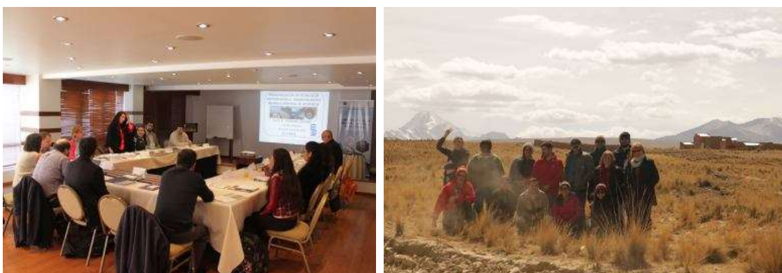
Introduction of the attendants and field trip over 4,100 m.a.s.l.

Again the IAH MAR Commission as well as MAR to MAR-k€t WG was presented to the attendants.