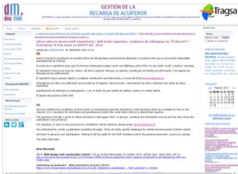
MAR books repository at DINA-MAR website

Holding the activity, the repository presented IN 2014 has been updated thanks to the contributions of the MAR family. It has overtaken the figure of 75 free books on MAR by December 2016. http://www.dina-mar.es/post/2016/12/29/ACTUALIZACION-DIC-2016-Libros-sobre-la-tecnica-MAR-(repositorio)-MAR-books-repository.aspx