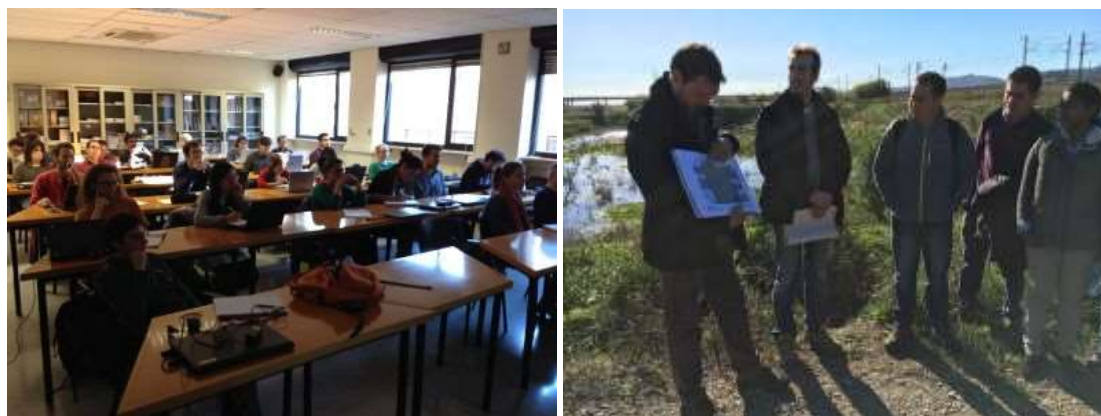
Barcelona ASC where organizers allowed a MtoM presentation

As usually, MAR to MAR-k€t was exposed to the audience.