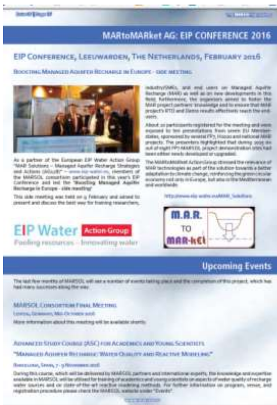
MARSOL Newsletter 5