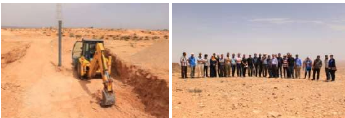
MAR capacity building. Medenide field trip, Tunisia, 2016, May.

The capacity building course took place in Zarzis, near Medenine, Tunisia from 2016 May 16 to 20th and counted with 25 practitioners from Algeria, Tunisia and Italy. The IAH MAR Coimmission and MtoM WG was presented to the attendants, with the incorporation of one of the organizing institutions into the WG.