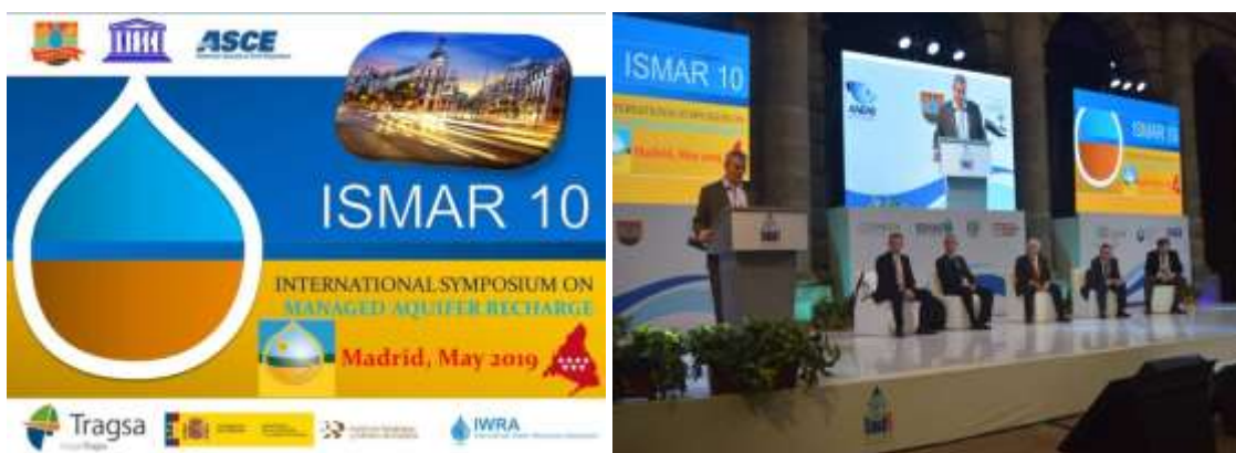
Presentation of Madrid as ISMAR 10 hosting city during ISMAR 9 plenary in Mexico.

The first institution, by means of some technicians, proposed and supports MtoM WG.