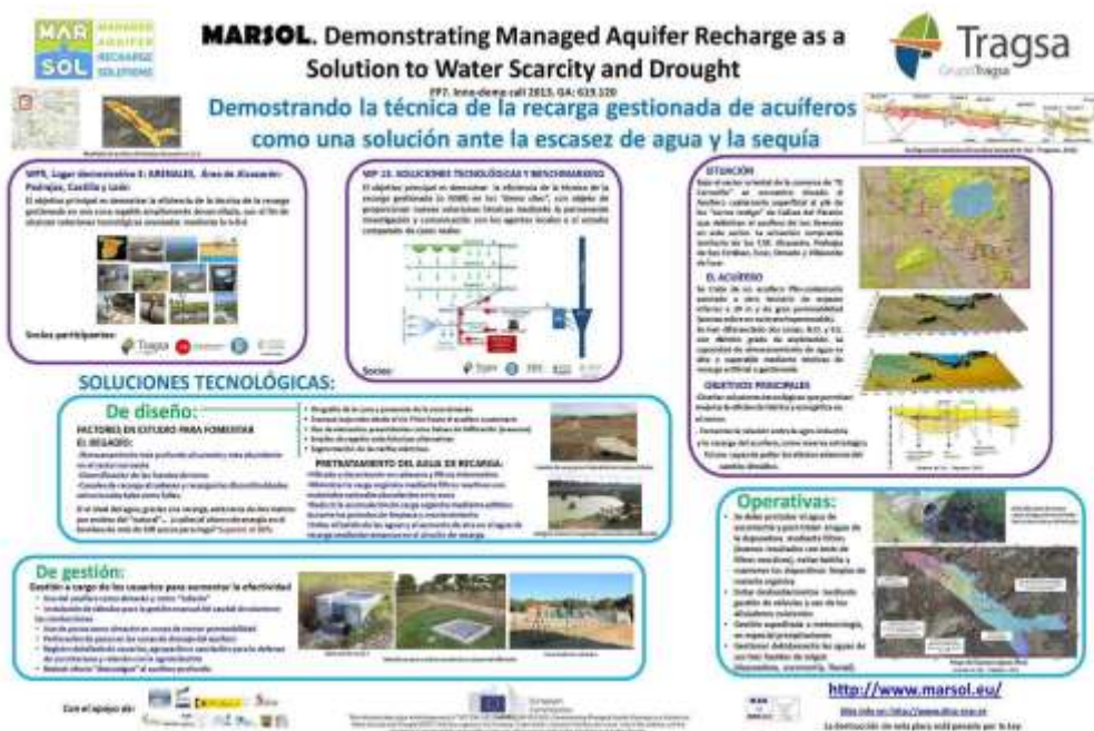
Metal dissemination posters installed in Arenales Demo Site

Holding the activity initiated in 2015, a new metal poster has been set up in a third pilot of Los Arenales aquifer, Alcazarén Area, as dissemination to end-users' example.