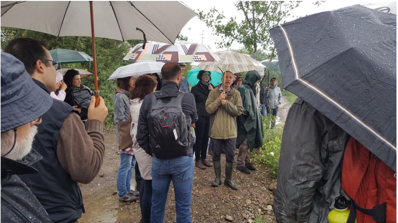
Field trip at the SUVERETO recharge scheme... during natural recharge!