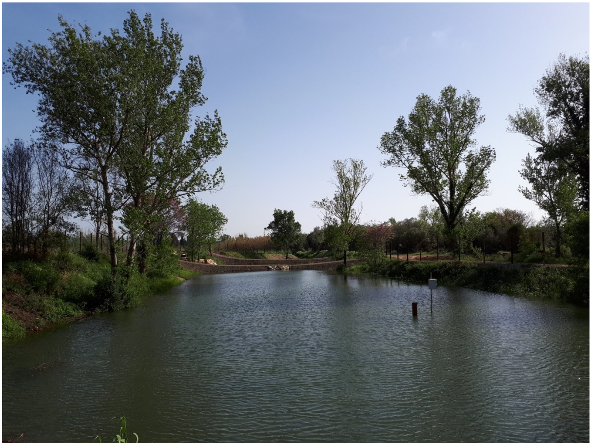
View of the Suvereto MAR scheme