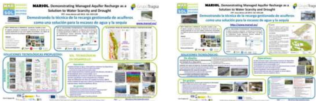
Metal dissemination posters installed in Arenales Demo Site

Metal dissemination posters were set up in the field.