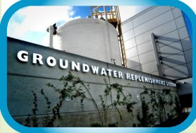
The Philip L. Anthony Water Quality Lab