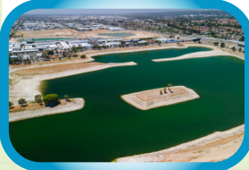
The Santa Ana River